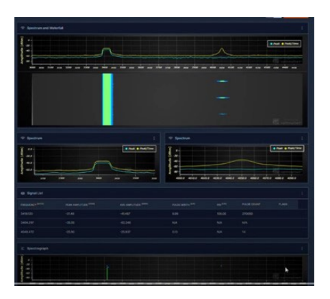
TSD-2000 ELINT Analysis Software Application